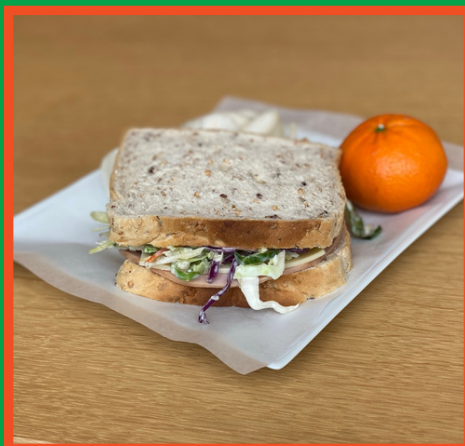
HAM & SALAD SANDWICH FRUIT