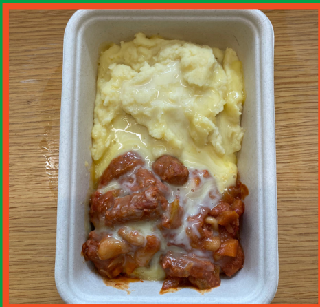
BEEF & CANNELLINI BEAN STEW ON MASH