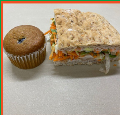
CHICKEN SANDWICH & BLUEBERRY MUFFIN