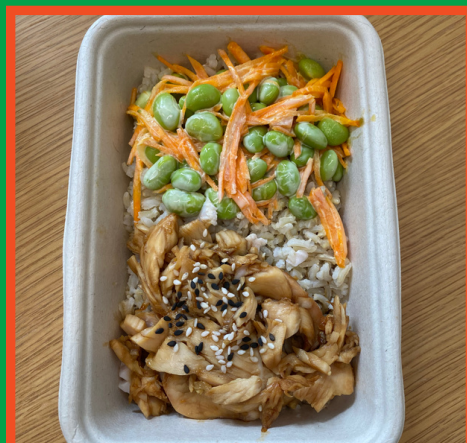
CHICKEN POKE BOWL