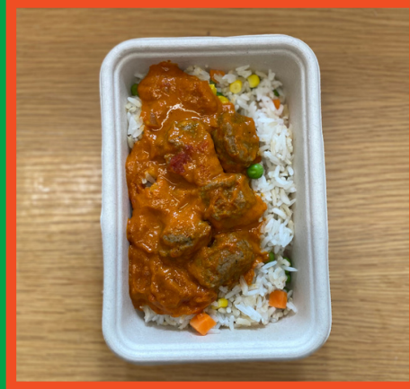
BEEF MEATBALL MASSAMAN CURRY