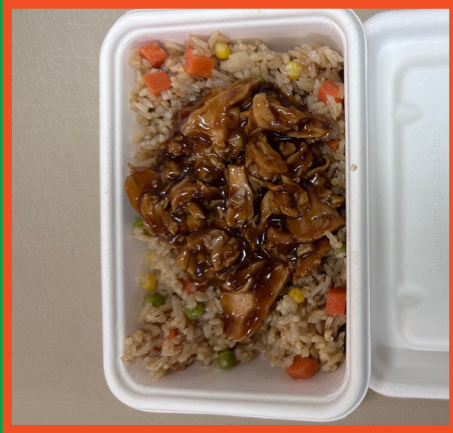
MONGOLIAN CHICKEN ON RICE